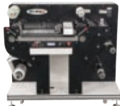
Arrow EZCut 330R