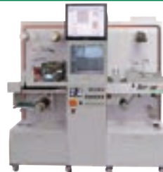
ArrowCut Nova 250R