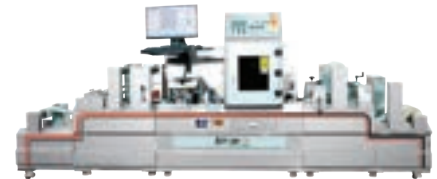
ArrowCut Nova 330R