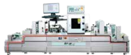
ArrowCut Nova 330R