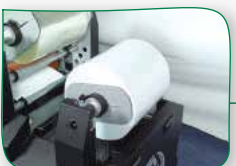
Unwinding system (350mm max web width / 400mm max roll diameter) Easy to install