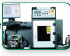
Laser system Upgraded result by using the latest laser engine.