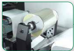
Lamination unit Laminating is possible