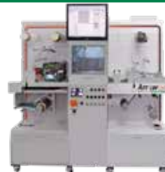
ArrowCut Nova 250R