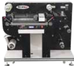
Arrow EZCut 330R