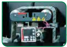
Web guide sensor - edge sensor, Line camera (Option) Correct the media path to the right spot

The ArrowCut Nova 330R is the latest in state of the art finishing capabilities. The ability to laminate, die-cut, remove matrix, and slit all in line allows users to speed up their digital finishing exponentially. An in-line web guide keeps the media running straight and increases the tolerance of the laser to .02 mm. Easy to use software allows you to be up and running in no time at all and a touch screen display allows you to see exactly how your system is operating. The ArrowCut Nova330R is truly the next generation of digital finishing technology!